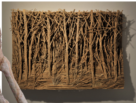
Forêt , 2013 90 x 130 x 17 cm, bois et carton, courtesy Galerie Suzanne Tarasiève, Paris, coll. part. © Olivier Toggwiller